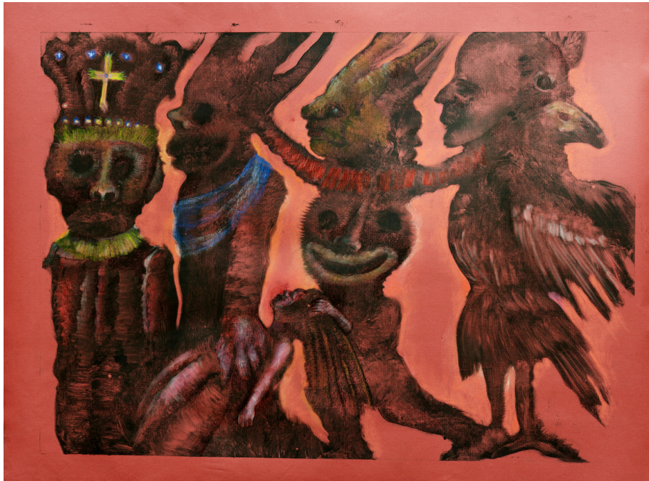
L'enlèvement, 2014 monotype on paper 70 x 80 cm © Polad-Hardouin Gallery