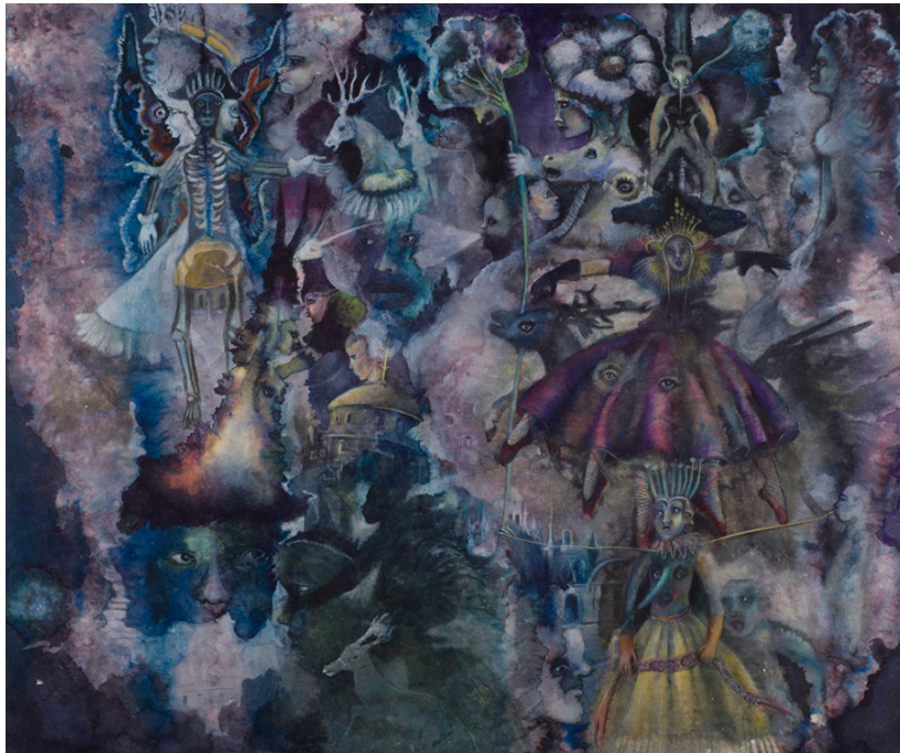
Purple Dancer, 2013/2014 mixed media on paper 110 x 160 cm