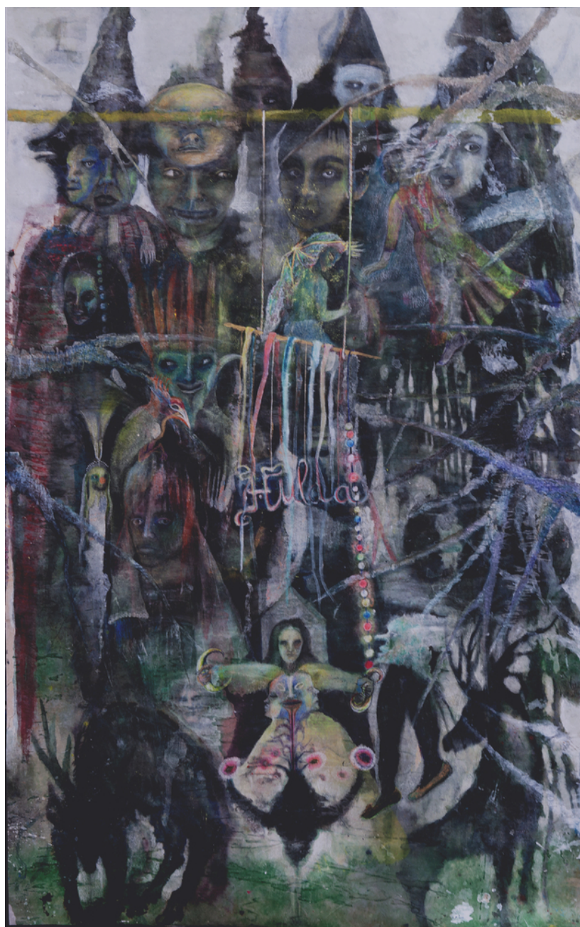
Hulda, 2014 mixed media on paper 160 x 100 cm © Polad-Hardouin Gallery

Sefolosa's work will be on view courtesy Polad-Hardouin Gallery at the Outsider Art Fair, from January 29 until February 1, at Center 548 in New York.