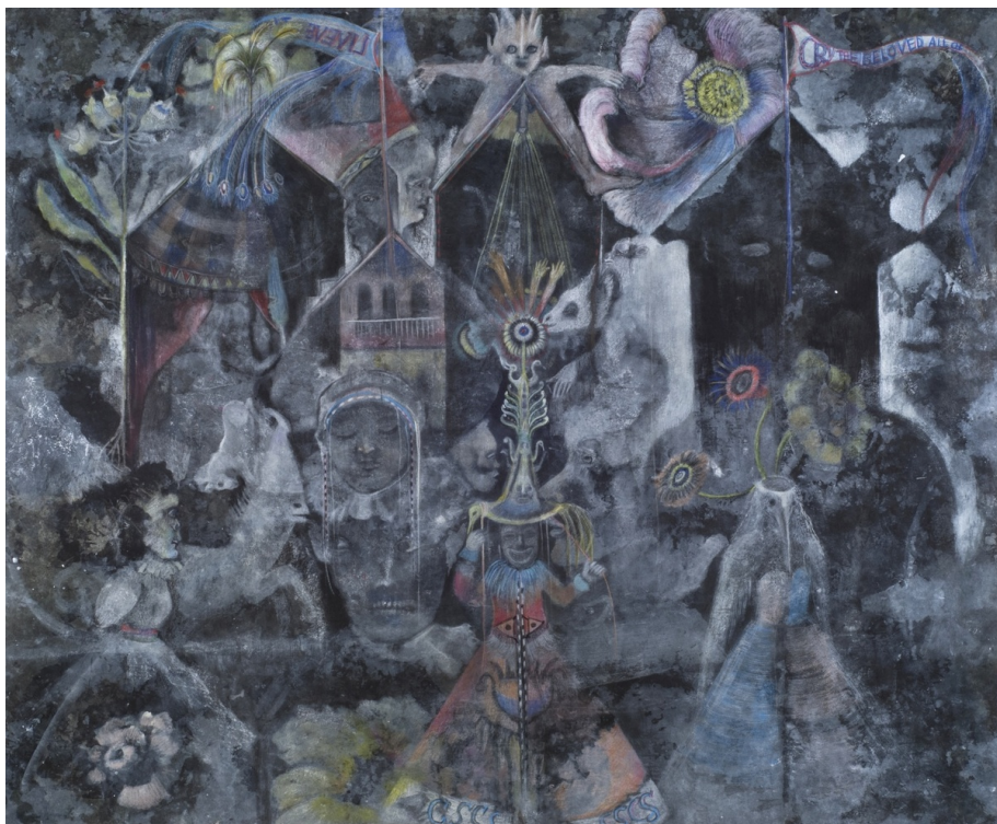
Cadet Rousselle, 2013/2014 mixed media on paper 110 x 160 cm