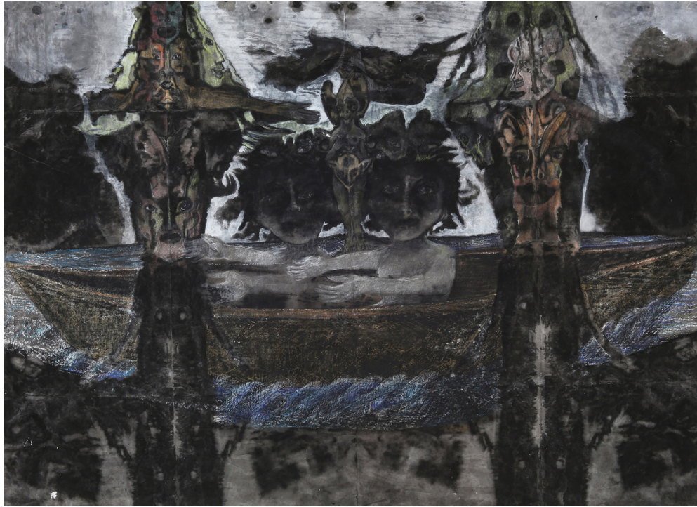
Le voyage, 2013/2014 mixed media on paper 100 x 158 cm