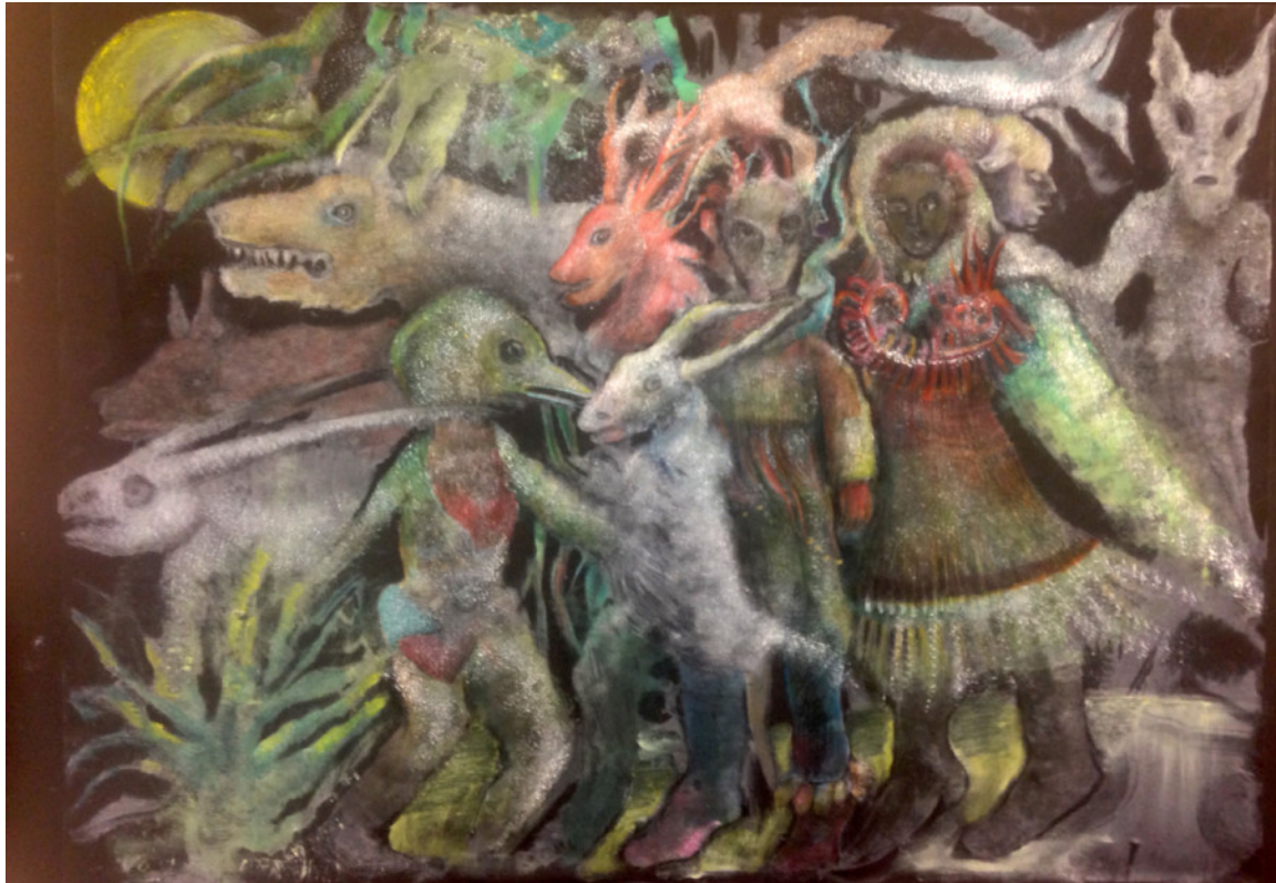
Trolls, 2014 monotype on paper 70 x 80 cm © Polad-Hardouin Gallery

Sefolosa's works, rendered using everything from paint to tar and dirt, occupy the space of the in-between, in those very first moments when legible shapes and details emerge out of the muck. In her watery depictions, creatures dwell in the state between man and beast, in a place somewhere between reality and folklore, making the viewer feel suspended between waking life and a dream state. Spectral queens mingle with prehistoric beasts, mutant birds and anthropomorphized tree stumps, rendering a surreal limbo in a constant state of transformation.